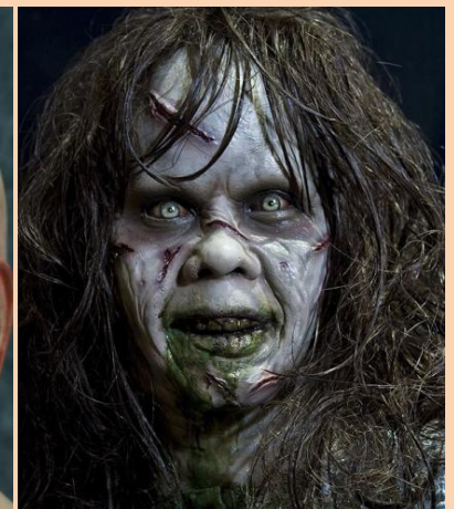
Killer Kits' The Exorcist