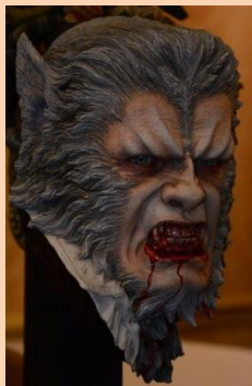
Black Heart's Werewolf

Some critics of "girl kits" argue that the future of the hobby is dependent upon new blood, youthful modelers counting on their moms and dads to finance their participation in this hobby. These critics say parents are reluctant to allow their kids to participate in a hobby with such strong sexual content. However, defenders and proponents of kits in this strong-selling sub-category question those who voice concerns about "girl kits" being "too adult". They point to the inherent adult nature of the many horror and sci-fi kits (and the magazines devoted to them) which depict the victimization of women and in which elements of graphic violence, blood and gore are prominently displayed.